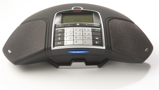
Avaya B169 Wireless Conference Phone

Enjoy a new level of freedom and convenience with conference calling