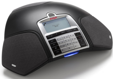
Avaya B159 Conference Phone